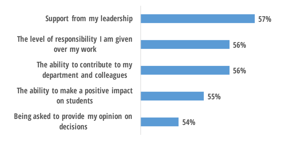
Figure 2. In 2019–2020, the top five reasons employees gave for why they felt valued were support from leadership, level of responsibility given over work, ability to contribute to department and colleagues, ability to make a positive impact on students, and being asked to provide their opinion on decisions.

Source. AISD Central Office Climate Survey 2019–2020