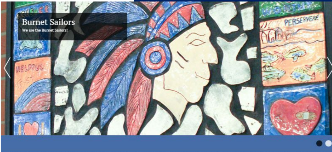
← Banner Image 1200x480