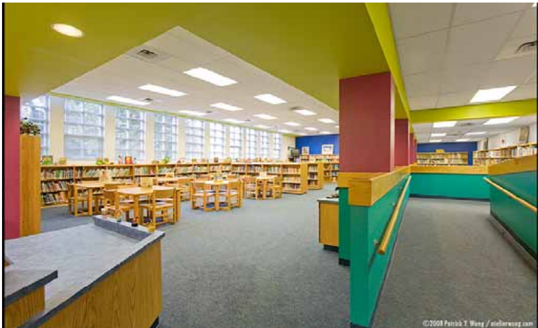
Travis Heights ES Library – Phase IV